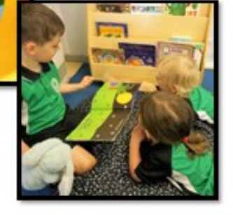
2024 Pre-primary Enrolments for children born between 1 July 2018 to 30 June 2019

We are now accepting Enrolments for Kindergarten and Pre-Primary at East Hamilton Hill Primary School Applications for enrolment closes on Friday, 21 July 2023